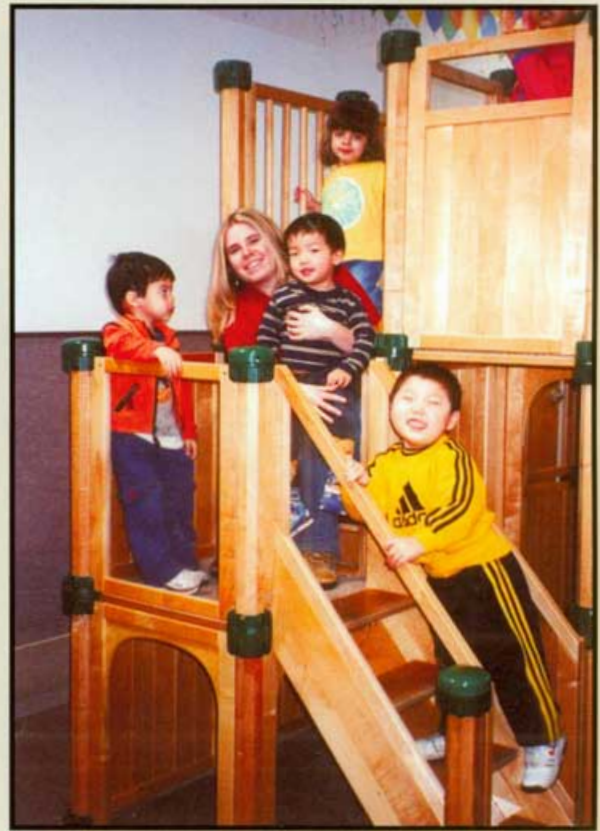
Indoor Recreation Room