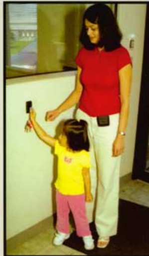
Key FOB Entry System