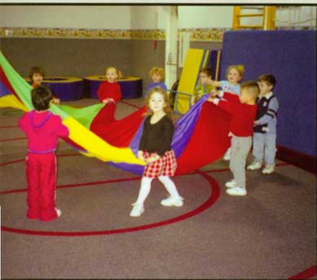
Gym instructor plans and leads our daily gym classes.

Daily gym classes are held in a fully equipped gymnasium designed by a consultant specializing in physical training for young children. The gym program develops the physical capabilities of the children, just as the classroom activities develop their academic and social skills. There is a library, a resource room with a computer, a kitchen where the children can learn to cook, and a conference room for meetings.