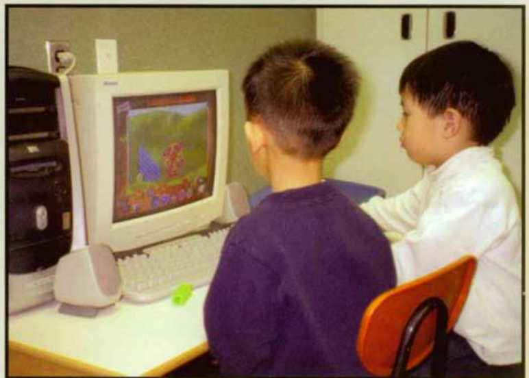
Resource room: Instruction for small groups.