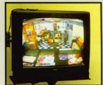
Closed Circuit TV