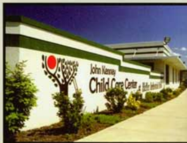
Privacy Wall / Fenced Yard